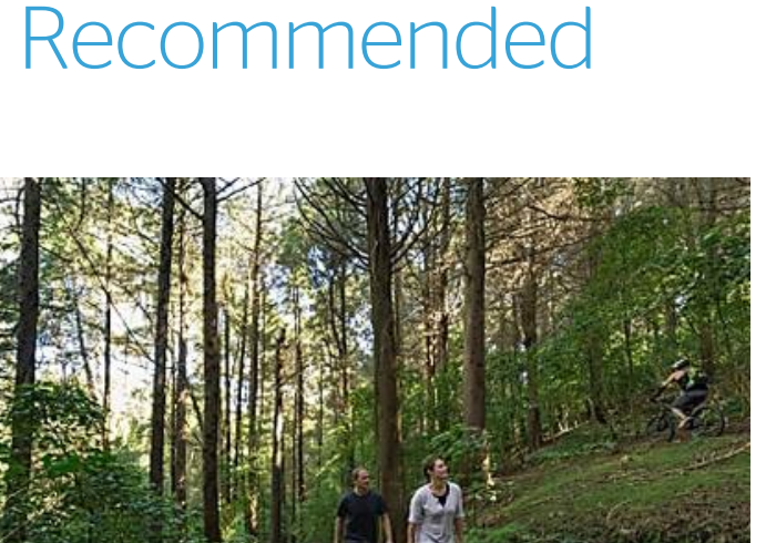
Pacific Coast Lodge and Backpackers put guests to work as environmental warriors