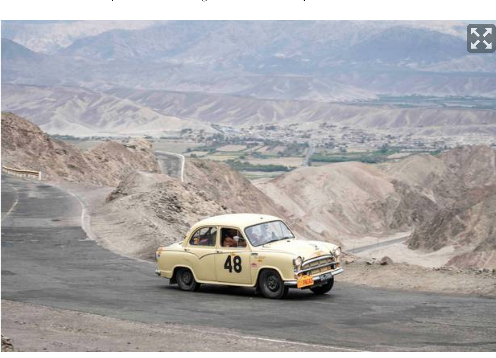
On the 27-day 2016 Rally of the Incas from Buenos Aires to Lima.

''It's had a bit of a rebuild since South America and I took it to a rally in the South Island to run it in.'' The Oxford has conquered some tough terrain in its rally career.