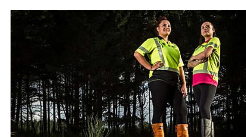
One billion trees snag? Bay of Plenty, Taupō face 'drastic' shortage of planters